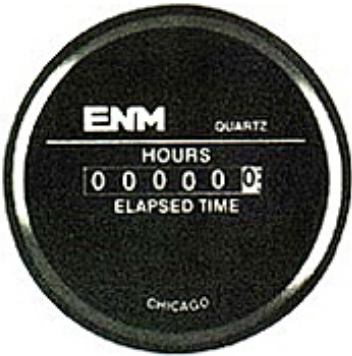
T40 Quartz DC Hour Meter T40 Quartz DC Hour Meter